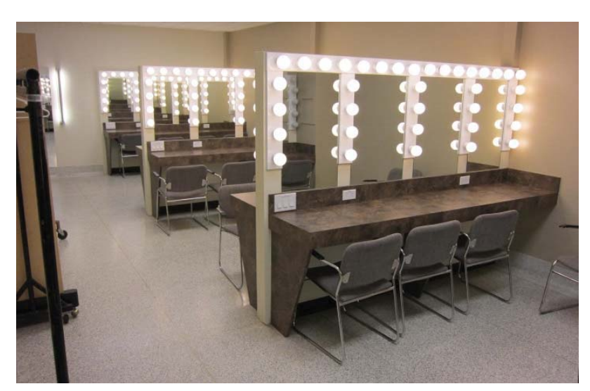
Chorus Room – lower level

Two chorus rooms with capacity for 20 in each room. (Lower Level)