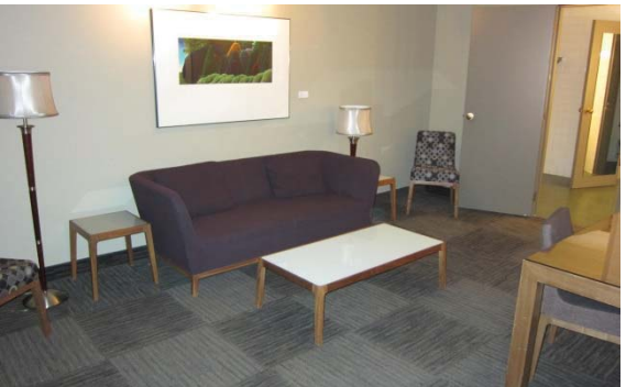
Star Dressing Room B

Two chorus rooms with capacity for 40 in each room (main level).