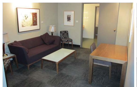
Star Dressing Room A

Two star suites each with capacity for four.